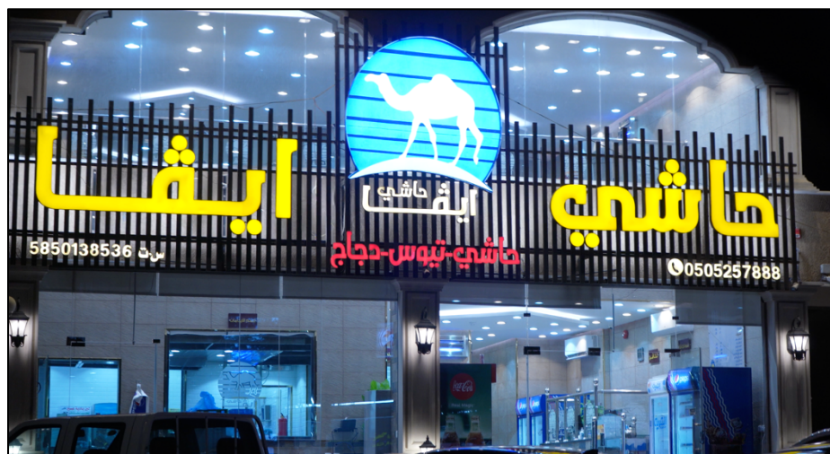
Ephah Camel Restaurant, Abha

The well-known Qaḥṭān tribe of Saudi Arabia has two subtribes called Āl ʿĪfah (Ephah) that are located in the vicinity of Abha. It is possible that these subtribes are linked with Ephah of the Bible. There is also a village named Ephah (associated with these Qaḥṭān groups) that is