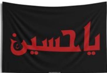
Ashura "Ya Hussein" Flag